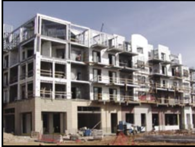
Branson, MO, Luxury condos

Branson Landing is a development that includes condominiums being developed in the midst of retail shops, dining, entertainment and recreation. These luxury condo residences will overlook Lake Taney. RWC will be performing extensive work on the condominiums and retail space, involving traffic coatings on the balconies, sheet waterproofing, and joint sealants. The grand opening is anticipated in May 2006. The approximate start on the next phase of work will be in February 2006.