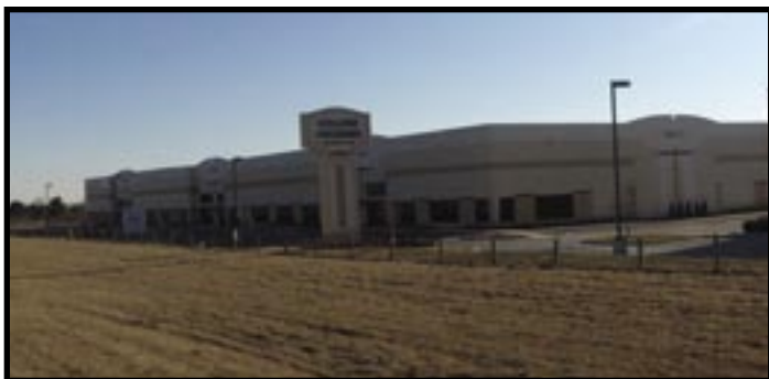
College Crossing Business Park, Lenexa, KS

Restoration & Waterproofing Contractors, Inc. of Kansas City installed sealants at College Crossing Business Park conveniently located at 109th and I- 35 in Lenexa, Kansas. These office-warehouse facilities were built by Merit General Contractors of Kansas City, for Block and Company and are prime retail and warehouse space in this section of the city.