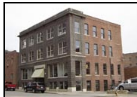
After restoration Adler Building, Kansas City, MO

The project involved extensive masonry restoration including removal of multiple coats of paint from the exterior brick and stone, 100% tuck-pointing, removal and resetting of the clay cap and painting of the metal cornice. The RWC team also cleaned and sealed the interior brick after the plaster was removed.