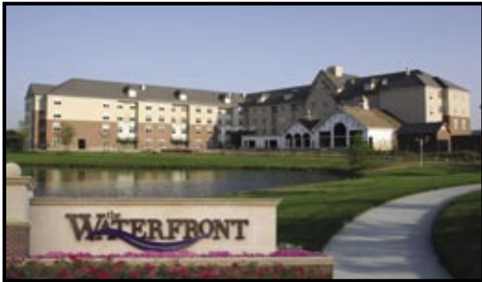
Homewood Suites by Hilton @ the Waterfront

Work on this beautiful new hotel located at the Waterfront in northeast Wichita began in August 2005, and is scheduled for completion in May 2006. Homewood Suites by Hilton @ the Waterfront, 1550 North Waterfront Parkway, is a high-end, extended stay facility with extensive amenities that enhance this developing area. The architects for the project are Browning and Associates of Wichita and general contractors are Pinnacle Construction Group, Inc of Wichita.