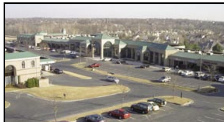
Hawthorne Plaza, Overland Park, KS