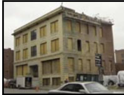
Before restoration Adler Building, Kansas City, MO

In 1918 the Adler Building was constructed under the direction of Isadore Adler and has a special place in Kansas City history. Located on 10th Street between Broadway and Central, this four-story building