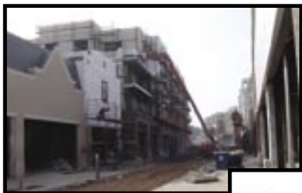
Branson Landing retail storefronts